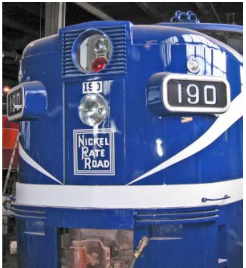
Three engines, 4 views. The 700 dwarfs Riley Petterson - above - and another admirer - below - while the 190 (above right) shows off its gleaming paint job and Al Pohlpetter (lower right) steadies the 4449. What a dedicated crew it takes to work on these historic engines.